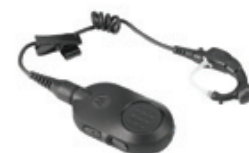
Operations Critical Wireless Earpiece

“When I first saw the MOTOTRBO SL Series I thought that it was a cell phone, not an actual two-way radio. It has all the capabilities of a two-way radio but with a professional, discreet look that fits absolutely well with all our uniforms.”