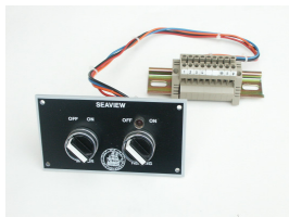
Operating panel for Seaview.