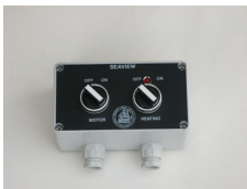
Operating box for Seaview.